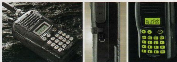
Water resistance, equivalent to IPX4 DC power jack Backlit LCD and keypad