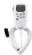
HM-157SW (Super white)