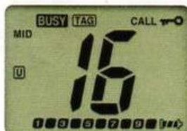
The photo shows actual display size.

* 35x24 mm, 1 \frac{3}{8} x1 \frac{5}{16} in. dimensions