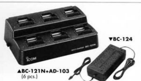
▲BC-121N+AD-103 [6 pcs.]

BC-119N DESKTOP CHARGER + AD-103 CHARGER ADAPTER + BC-145A/E/V AC ADAPTER For rapid charging of battery pack. An AC adapter may be supplied depending on version. Charging time: 1-2 hours. BC-121N MULTI-CHARGER + AD-103 DESKTOP CHARGER ADAPTER + BC-124 AC ADAPTER For rapid charging of up to 6 battery packs (Six AD-103s are required), BP-224. An AC adapter, BC-124, may be supplied, depending on version. Charging time: 1-2 hours.