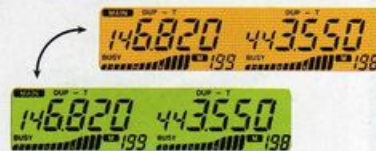
Selectable Green and Amber Display.