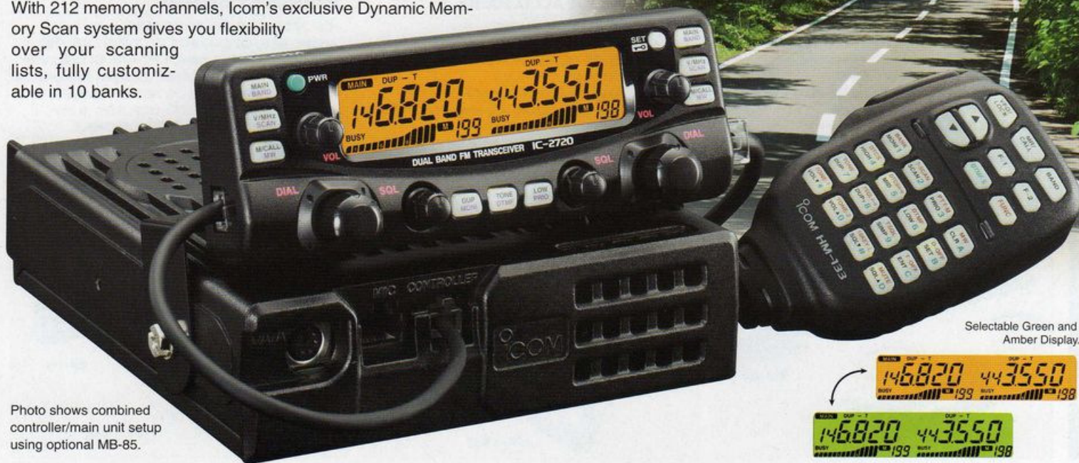
Photo shows combined controller/main unit setup using optional MB-85.